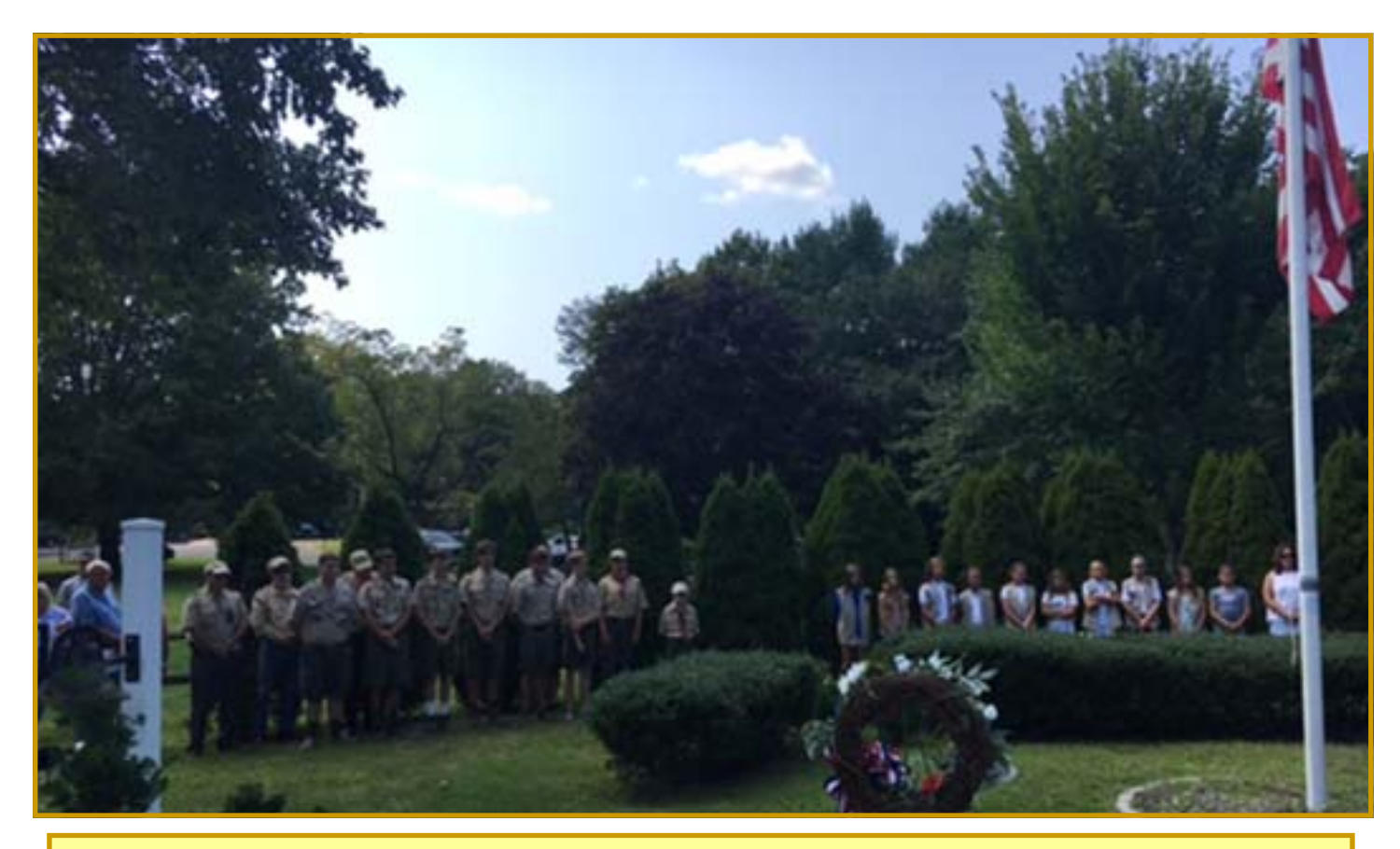
9/11 Memorial Observation