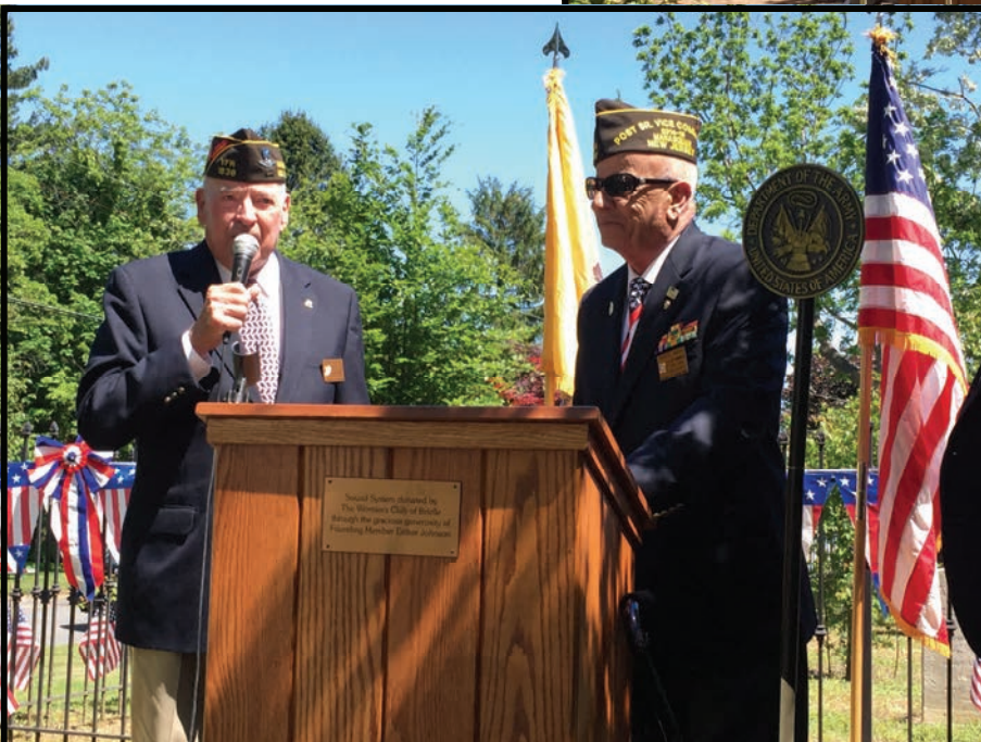
VFW Post 1838 Members