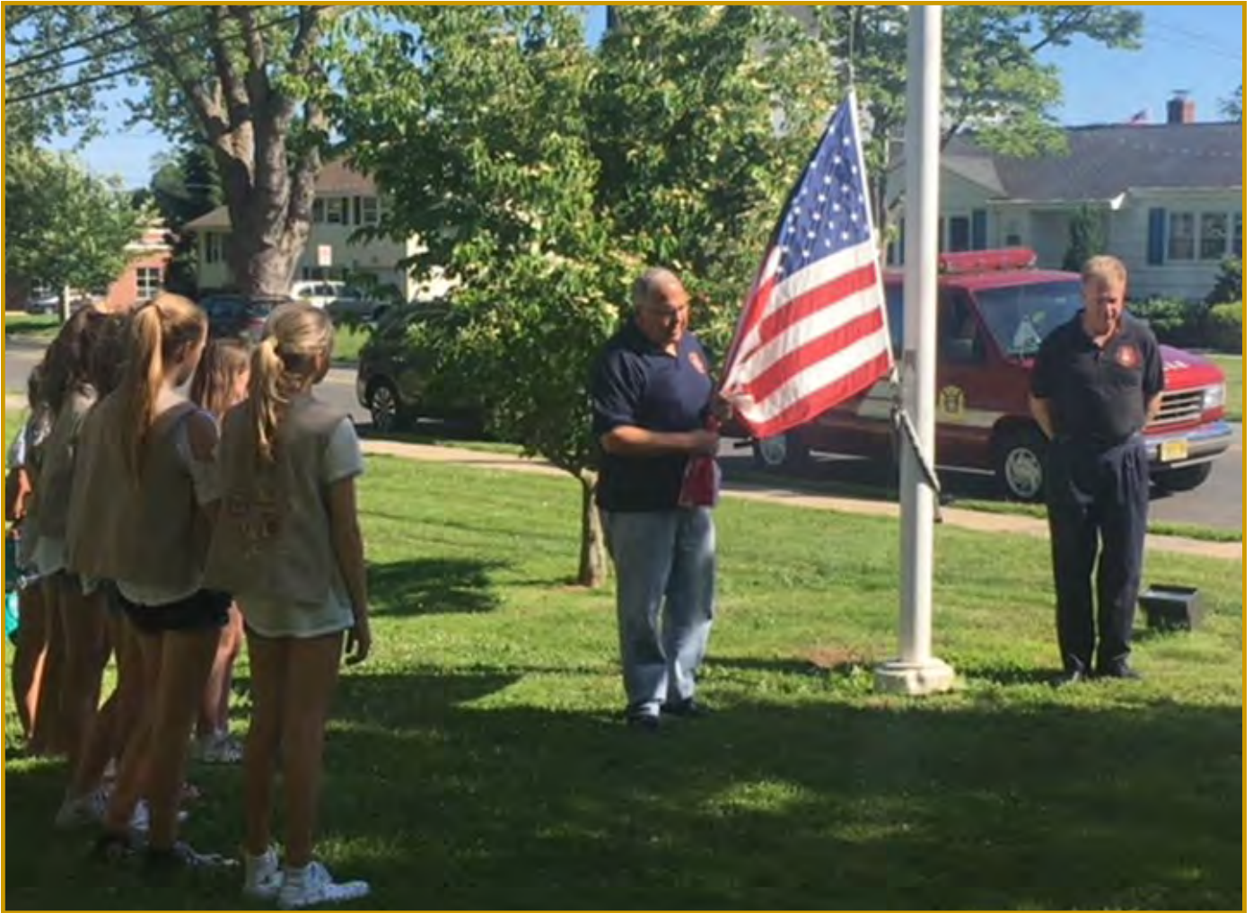
Flag Day - June 2018