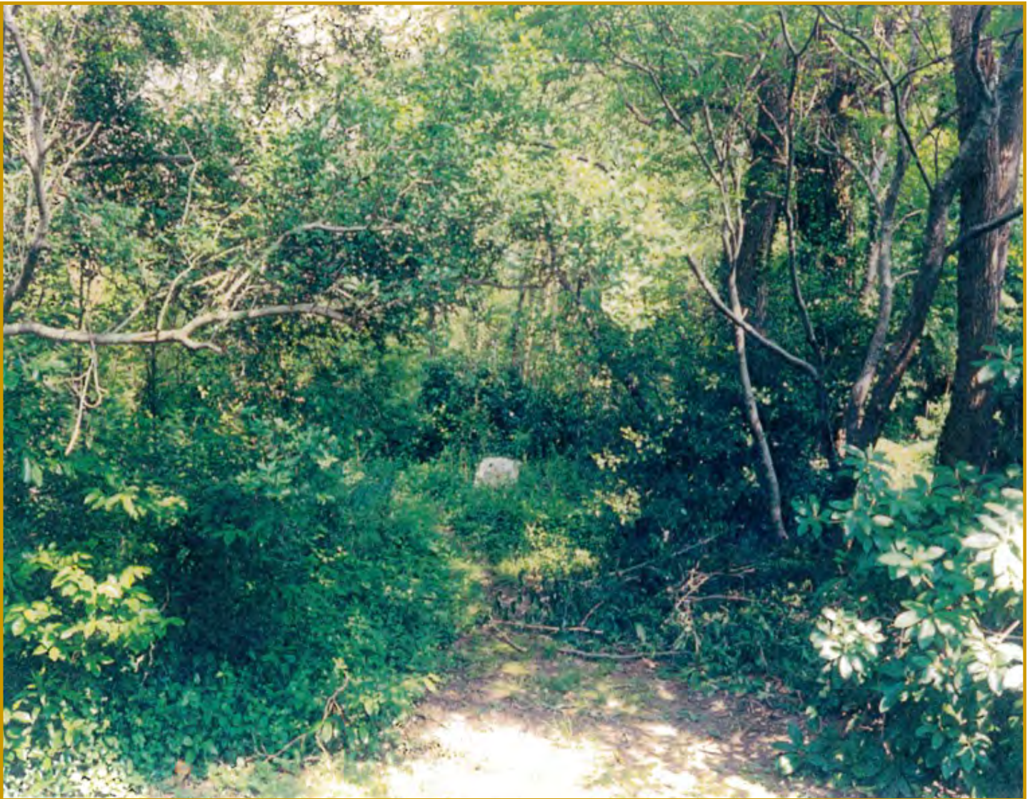
The Graveyard Before its Restoration in 2000