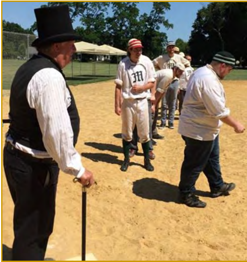
Vintage Baseball Game - June 2018