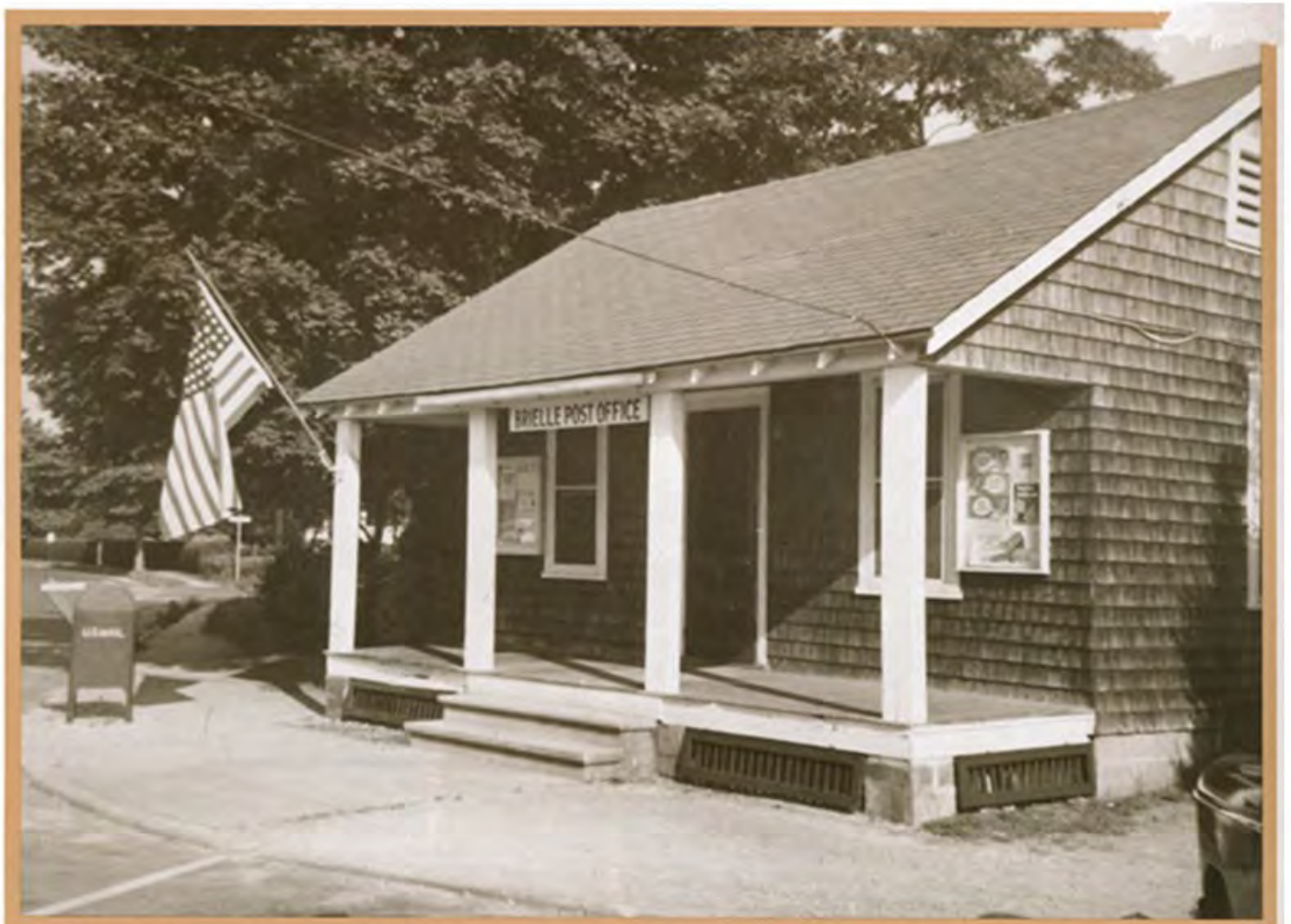
The Post Office on Green Avenue circa 1950s. The slot for receiving mail located to the right of the front door could no longer accommodate the ever-growing town. Notice the new mailbox to the left.