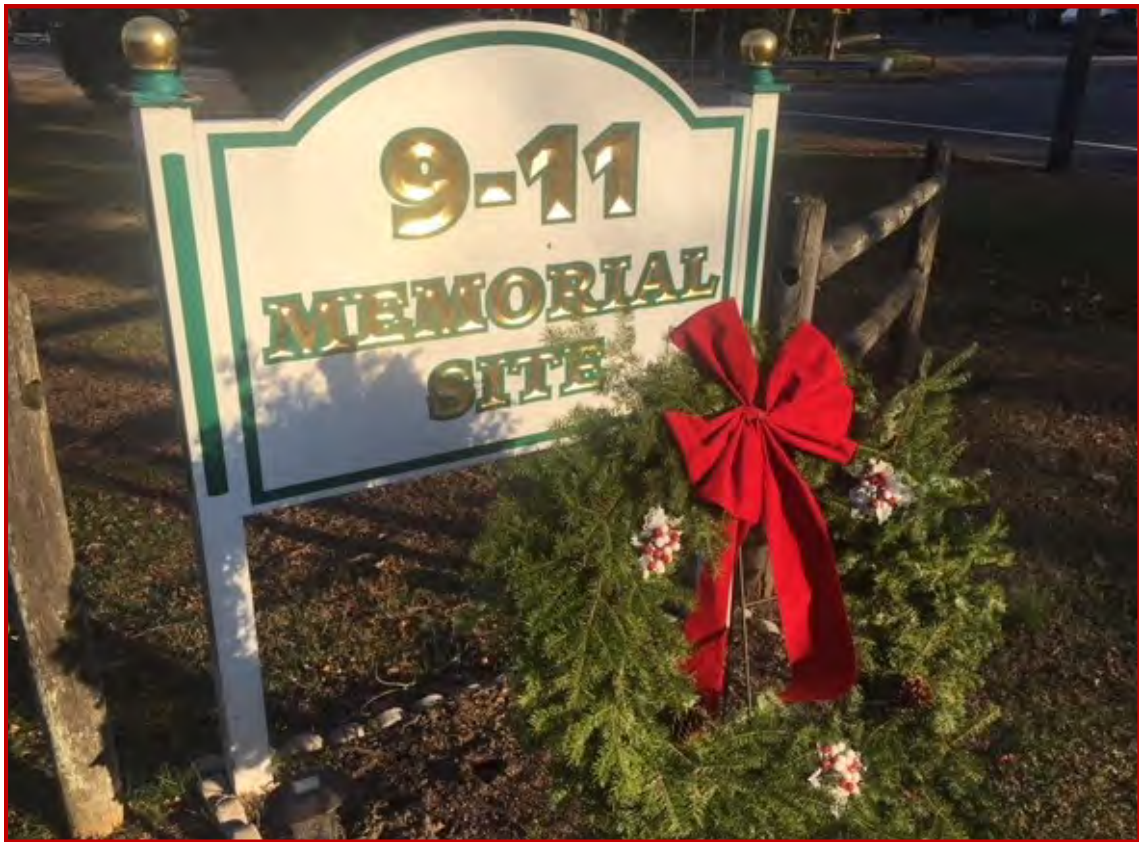
9/11 Memorial Site Decorated for the Holidays - December 2018