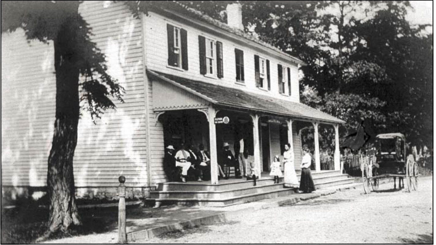
Early Brielle Post Office on Union Lane