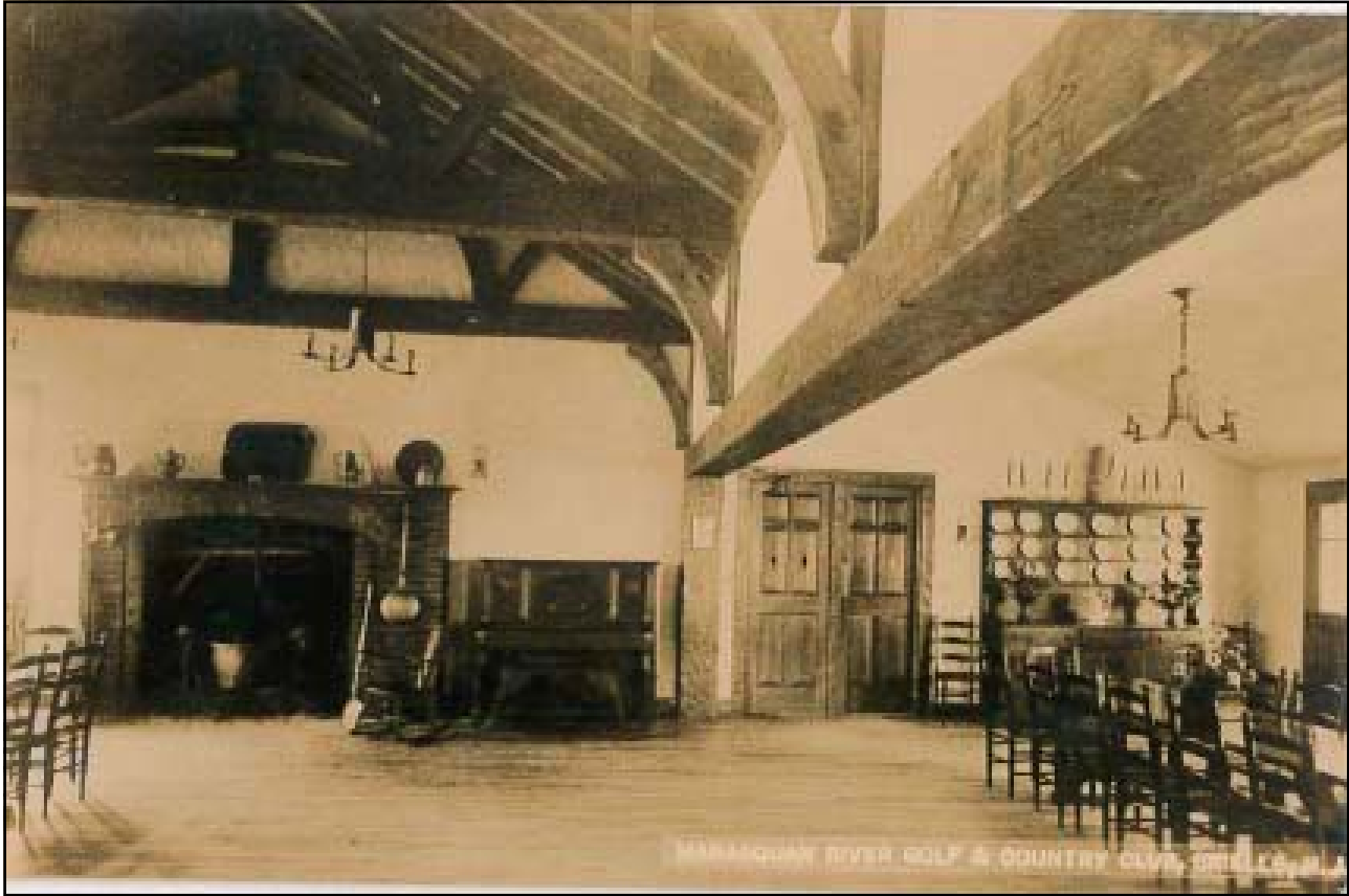
Manasquan River Golf Club