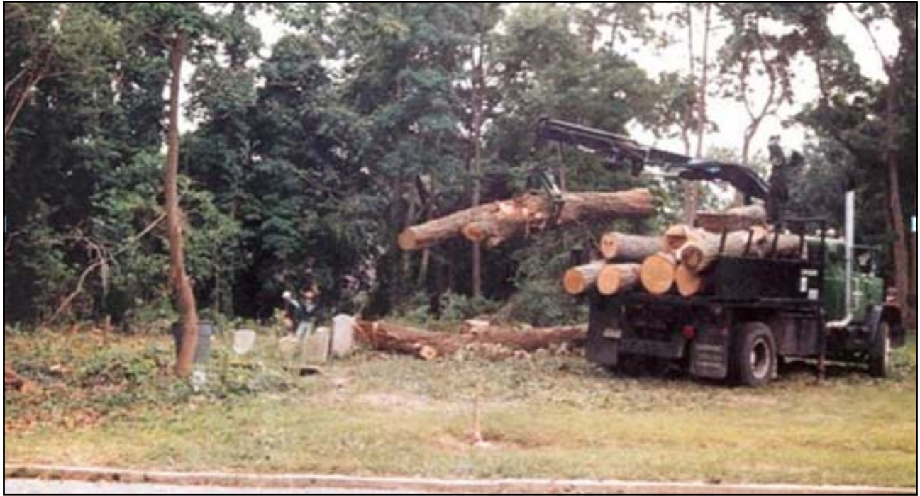
Clearing the overgrown Osborn Family Burial Ground and unearthing grave sites