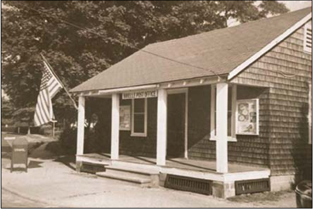
Brielle Post Office on Green Avenue