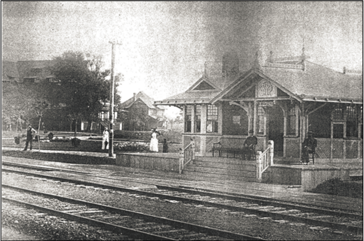
Brielle Railroad Station (above) and Train (below)