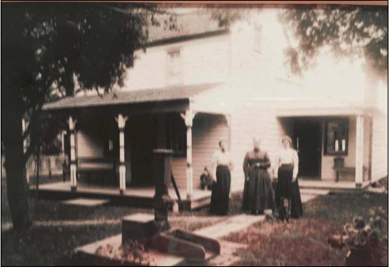
Longstreet Farm (Boxwood) Cottage (circa 1820) - then (above) and now (below)