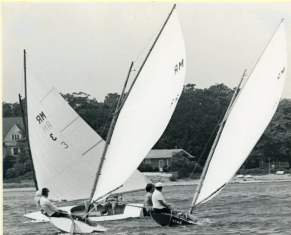
< Beaton Sneakboxes (1971)