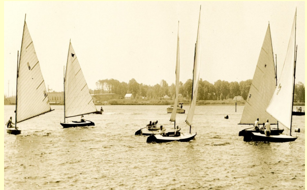
Perrine Sneakboxes > (1954)