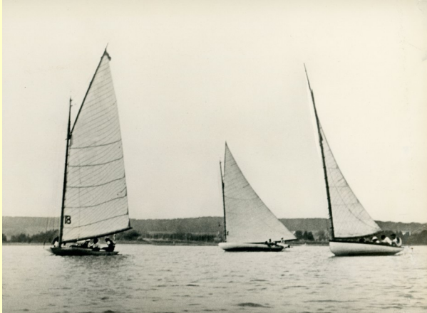
< Cat Boats (1909)